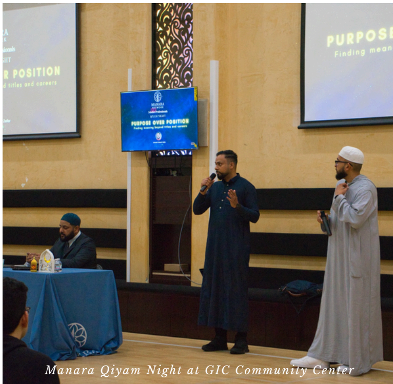
Manara Qiyam Night at GIC Community Center

Throughout Ramadan, the sisters of the community gathered daily to collectively read one juz of the Qur'an, working together toward a complete khatam by the end of the month. This consistent effort created a strong sense of sisterhood and unity, as participants bonded through shared ibadah and reflection. The culmination of their khatam was a deeply meaningful moment, representing not only the completion of the Qur'an, but also the relationships and spiritual growth developed along the way.